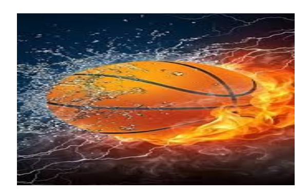
Excellence is not a singular act, but a habit. You are what you repeatedly do.