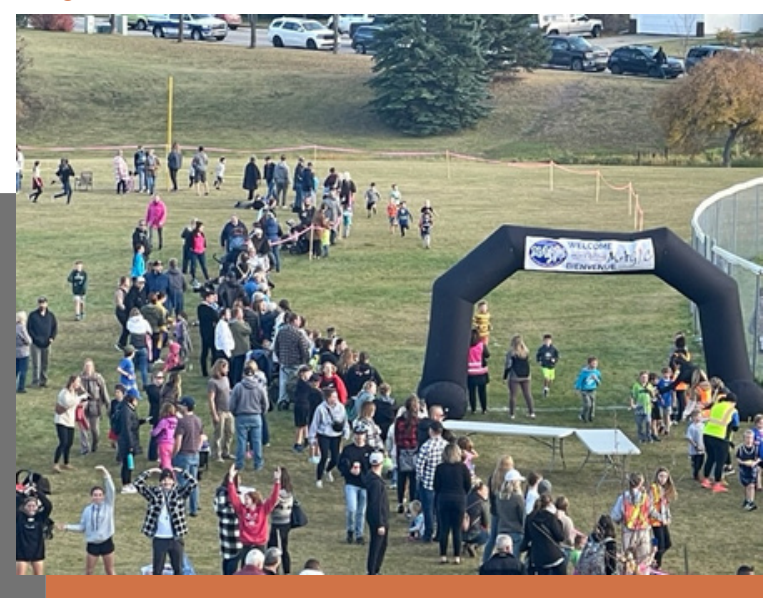
Crossing the finish line at the annual Meridian Cross Country Race